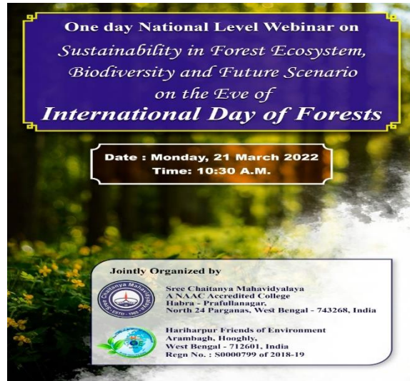
Fig. Observation of World Forest Day (WEBINAR)